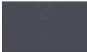
2204 poppy seed