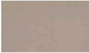
2187 brown rice